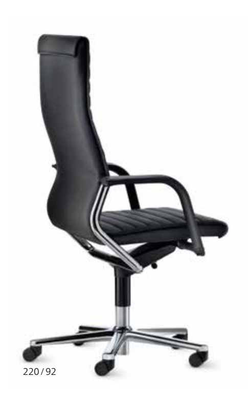
Further information at: www.wilkhahn.com/fs

Standards\ and\ certificates.\ For\ up-to-date\ environmental\ information,\ please\ visit\ the\ Wilkhahn\ website.