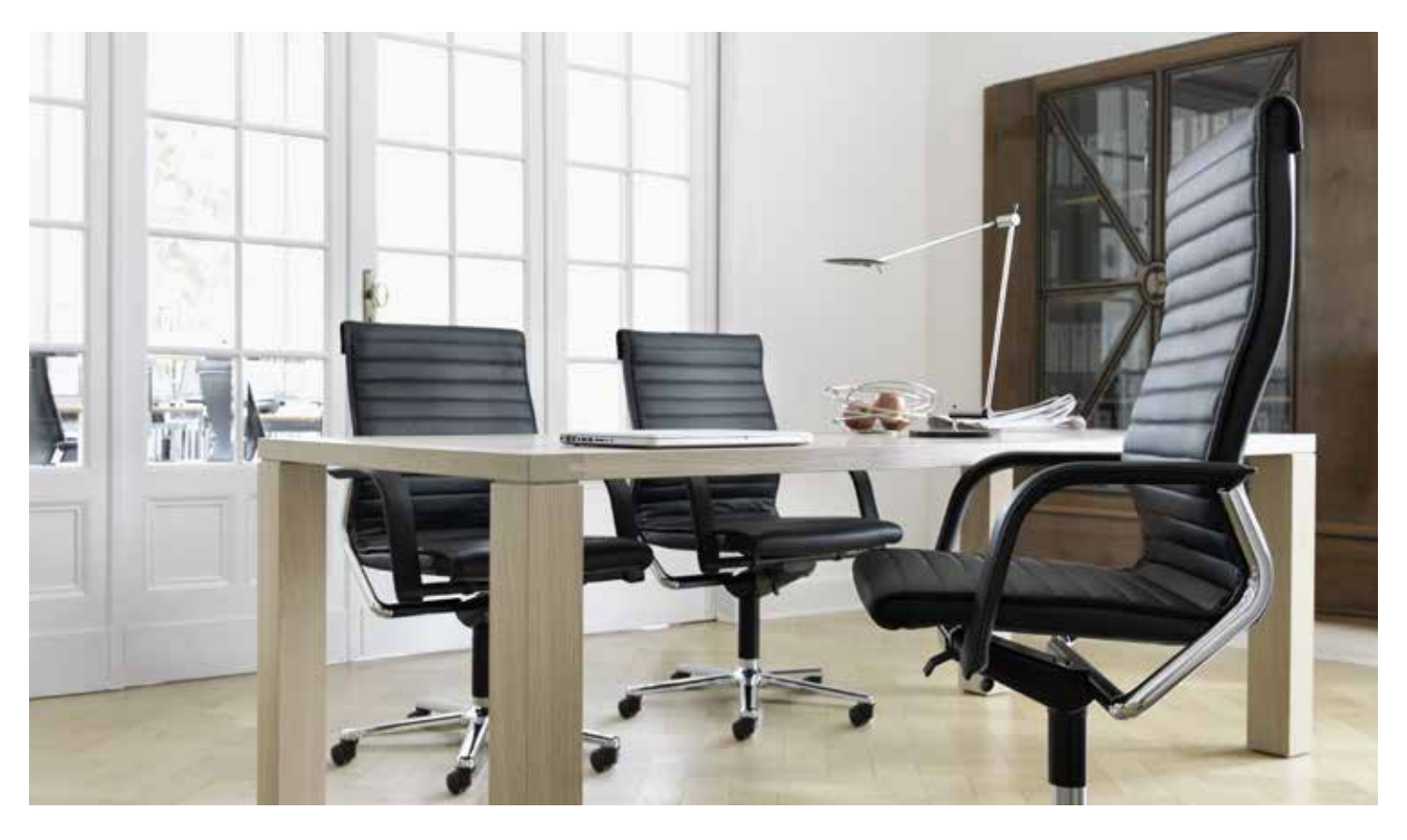
The FS Management models are available as office or conference chairs in two backrest heights, exclusively with bright chrome-plated frames and robust leather. After all, we want them to keep their owners company for decades. FS Management is extremely good value, reflecting current trends in management styles and dynamic seating. As a result, it is the ideal choice when a touch of gravitas, as well as healthy and comfortable dynamic seating, are required.