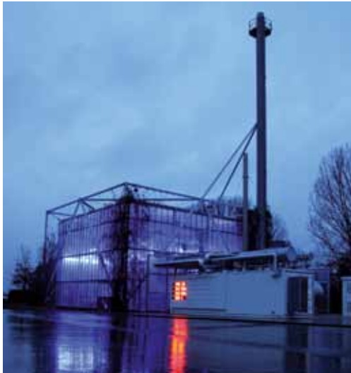
Co-generator powered by renewable raw materials

Both the main Wilkhahn production site and all European sales offices are certified in accordance with ISO 9001. When selecting suppliers, Wilkhahn assigns great value to a comprehensive and viable quality management system.